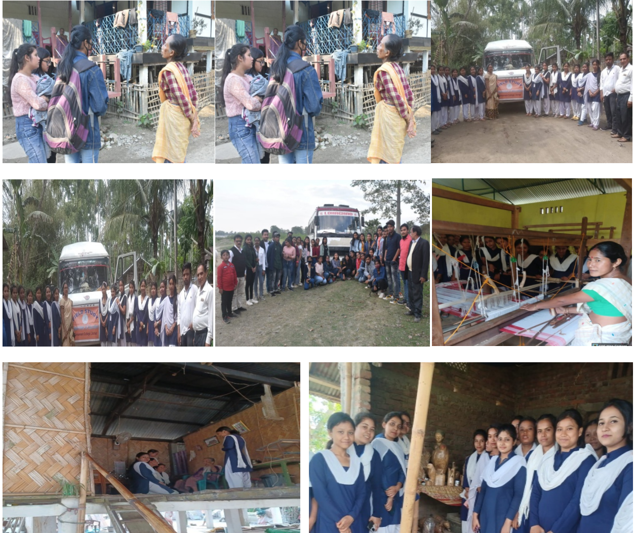
PHOTOGRAPH OF FIELD STUDY