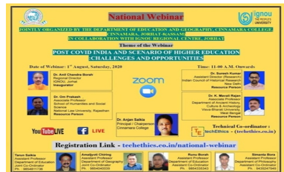
IMAGES AND PAPER CUT OF SEMINAR AND WEBINER