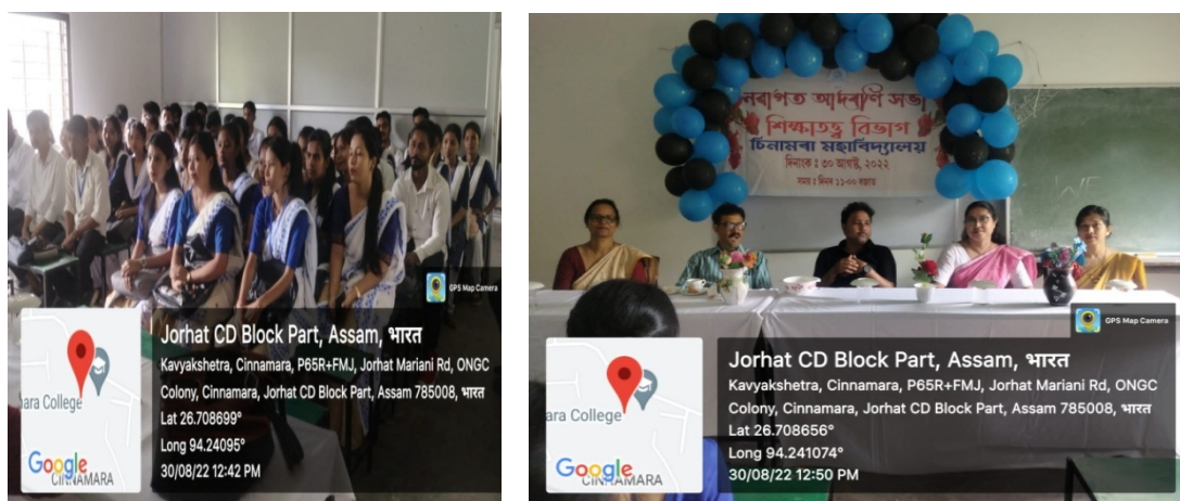
PGOTOGRAPH OF DEPARTMENTAL FRESHMEN SOCIAL