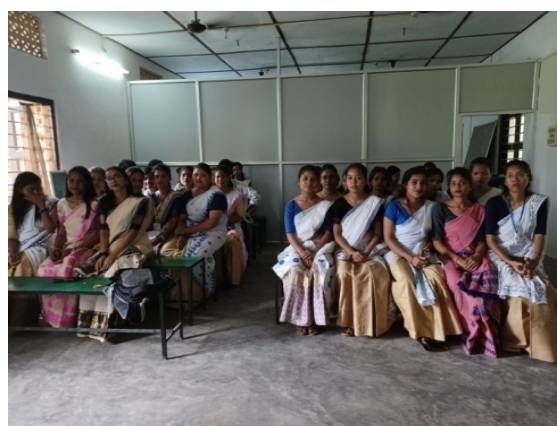
CELEBRATION OF RABHA DIVAS