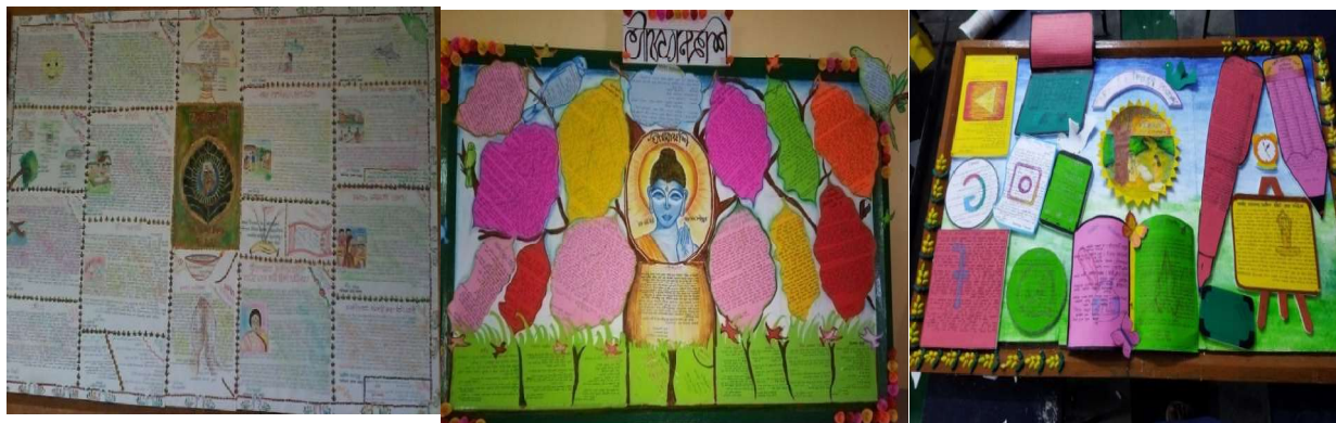
SOME IMAGES OF WALL MAGAZINE

THE STUDENTS OF THE DEPARTMENT PUBLISHED A WALL MAGAZINE AND TAKE PART IN WALL MAGAZINE COMPETITION ORGANIZED BY STUDENT UNION OF THE COLLEGE.